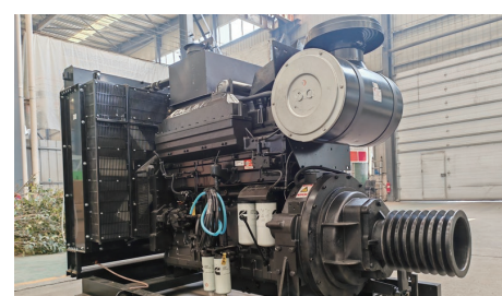
Top-Tier Diesel Engine