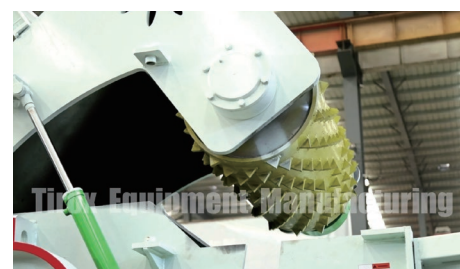
Smart Feeding System