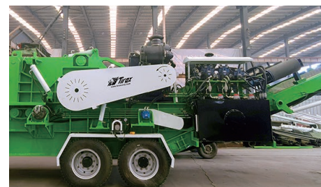
Hydraulic Forced Feeding System